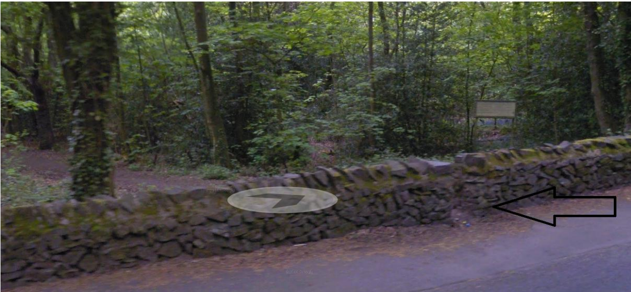
Car Park A Entrance at Castle Rock School/King Edward VII College on Meadow Lane: